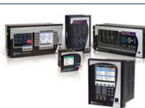
POWER AND DRIVES