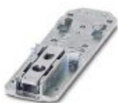
Universal DIN rail adapter