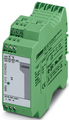
Primary-switched MINI POWER supply for DIN rail mounting, input: 1-phase, output: 24 V DC/1.5 A

Please be informed that the data shown in this PDF Document is generated from our Online Catalog. Please find the complete data in the user's documentation. Our General Terms of Use for Downloads are valid ( http://phoenixcontact.com/download )