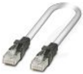
Patch cable, CAT5, assembled, 1 m

Patch cable - FL CAT5 PATCH 1,0 - 2832276