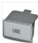
Marker carriers - UBE - 0800310

Terminal strip marker carriers for marking terminal groups, for end bracket E/UK or end clamp E/U, lettering field size: 40 x 17 mm