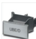
Marker carriers - UBE/D - 0800307

Terminal strip marker carrier for marking groups of terminals, for mounting on NS 32 or NS 35/7,5 terminal strips, marking field size: 40 x 17 mm