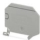
Partition plate - ATP-UT-TWIN - 3047183

Partition plate, length: 62.1 mm, width: 2.2 mm, height: 52.5 mm, color: gray