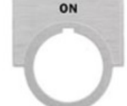
> 52NL11 | US2:52NL11 Accessory for Class 51 & 52 Legend Plate, Brushed Aluminum Large (1 1/4" x 2") Inscription: On