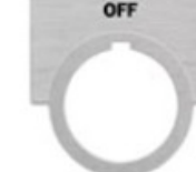
> 52NL12 | US2:52NL12 D55247012 Legend