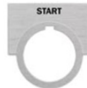
> 52NL03 | US2:52NL03 D55247003 Legend