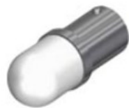
> 52AED4 | US2:52AED4 24 Volt amber