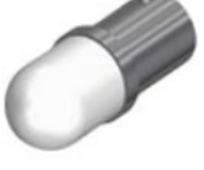
> 52AEE4 | US2:52AEE4 120 Volt amber