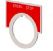
> 52NL16R | US2:52NL16R Accessory for Class 51 & 52 Legend Plate, Red Aluminum Large (1 1/4" x 2") Inscription: Emerg. Stop