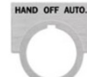
> 52NL37 | US2:52NL37 D55247037 Legend