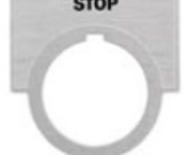
> 52NL04 | US2:52NL04 D55247004 Legend