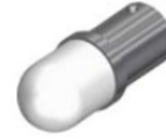
> 52AEDB | US2:52AEDB 24 Volt white