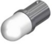
> 52AEE2 | US2:52AEE2 SIEMENS