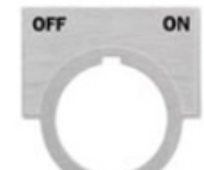
> 52NL26 | US2:52NL26 Accessory for Class 51 & 52 Legend Plate, Brushed Aluminum Large (1 1/4" x 2") Inscription: Off-On