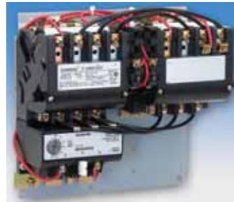
Reversing Non-Combination: Class 22 Combination: Class 25, 26