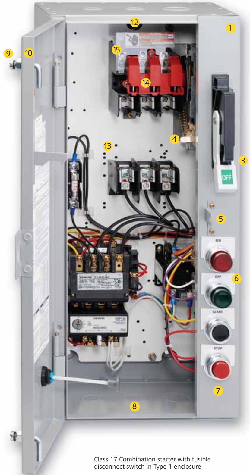
Class 17 Combination starter with fusible disconnect switch in Type 1 enclosure