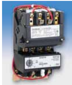
Non-Reversing Non-Combination: Class 14 Combination: Class 17, 18

Siemens manufactures a broad range of starters designed to meet all of your most demanding applications. Included in our line of NEMA starters are full and reduced voltage starters, reversing and non-reversing starters as well as two-speed starters. Starter sizes range from 00 to 8 including Siemens exclusive motor-matched half-sizes which saves you money and space.