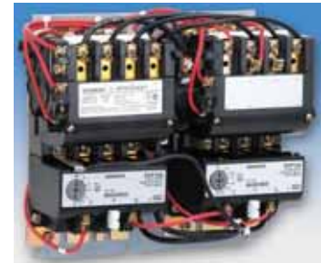
Two-Speed Non-Combination: Class 30 Combination: Class 32