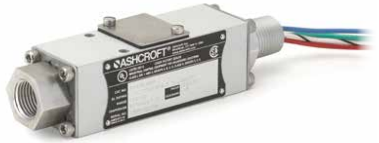
F-Series Explosion-Proof Enclosure